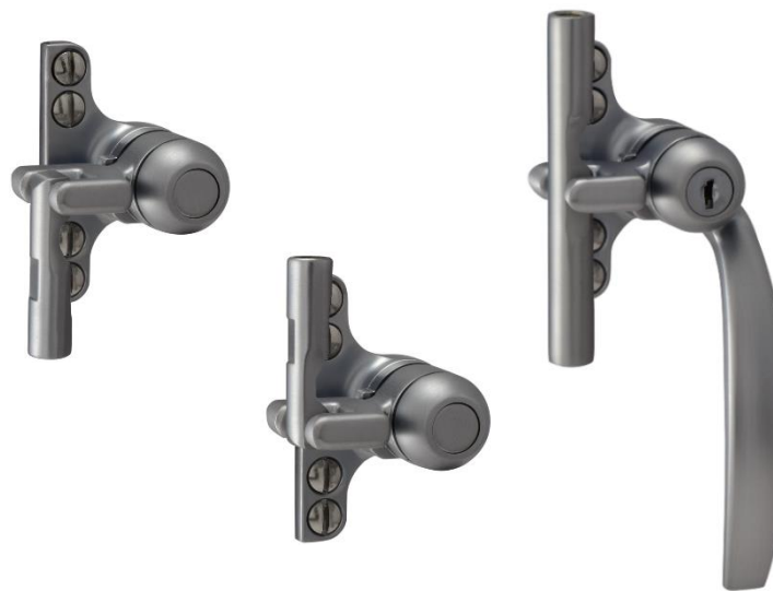
B646NOSE & 2 Connectors

Steel Window Fittings / Window Handles / B918/Triplex